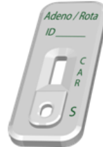
Adeno/Rota Combo Test Card